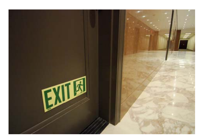
Exhibit 3: Stairwell entry doors showing low placement of the photoluminescent emergency exit sign.