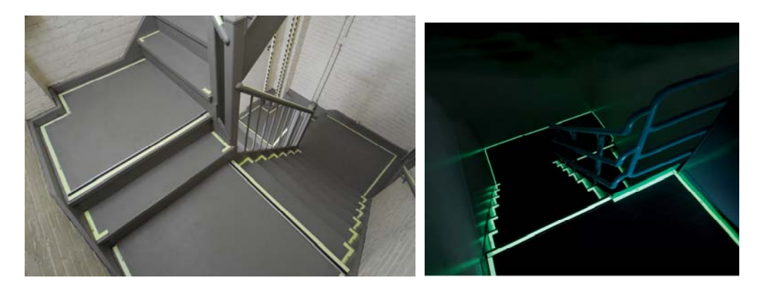
Exhibit 5 Photographs showing RS 6-1 code-compliant components installed, (landing perimeter marking, top step marking, and "L" markers on all subsequent steps).