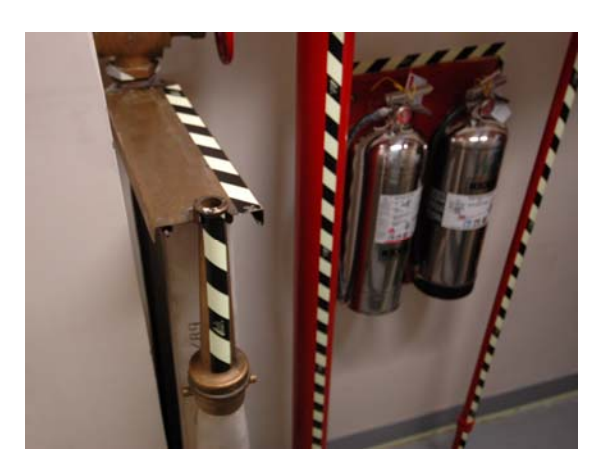
Exhibit 7 Obstacle tape installed.

more than 2 inches thick and angled at 45 degrees. Examples of such obstacles include standpipes, hose cabinets, wall projections, and restricted height areas, see Exhibit 7. This requirement is for both new and existing buildings.