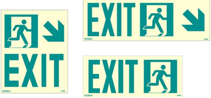
Exhibit 2. Stairwell entrance door signs shown with and without arrows.