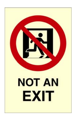
Exhibit 9 Sign for non-exit door using optional NFPA "no exit" symbol.

From a national standards perspective, I believe that the addition of the NFPA 170 "Not an Exit" symbol (Exhibit 9) is a worthwhile addition to this text message sign. Also note that though the RS 6-1 standard does not contain stipulations to replace the already code-required "Re-entry Door" information signs with photoluminescent versions, in dark conditions this information is essential for evacuees. Many building owners will go the extra step to replace existing re-entry door signs with photoluminescent versions that meet the RS 6-1 material characteristics.