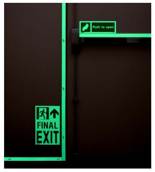
Exhibit 10 Final Exit door showing mandatory sign, perimeter marking, pushbar marking, and optional "Push to open" sign.

To easily locate the door, RS 6-1 mandates that the top and sides of the door frame of all intermediate and final exit doors must be marked with a solid and continuous 1- to 2-inch-wide stripe of photoluminescent material. Gaps are permitted in the continuity of door frame markings where a line is fitted into a corner or bend, but the gap should be as small as practicable and in no case greater than 1 inch. RS 6-1 goes on to state that if the door molding does not provide enough flat surface on which to locate the stripe, the stripes may be located on the wall surrounding the frame.