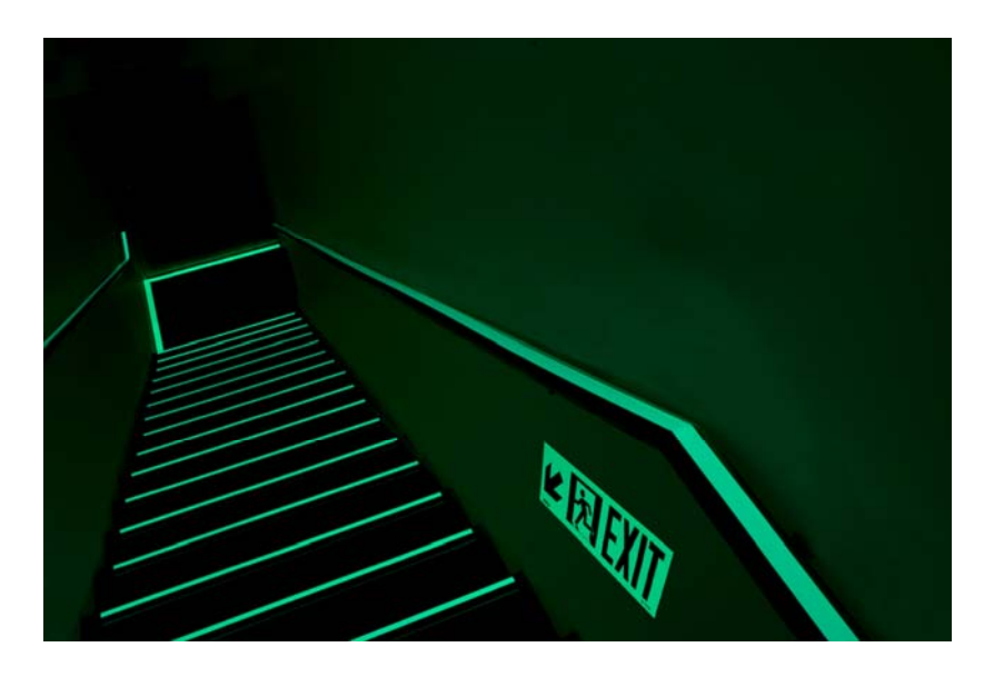
Exhibit 6 Photograph of an installation showing minimum compliance components for an RS 6-1 new building installation.