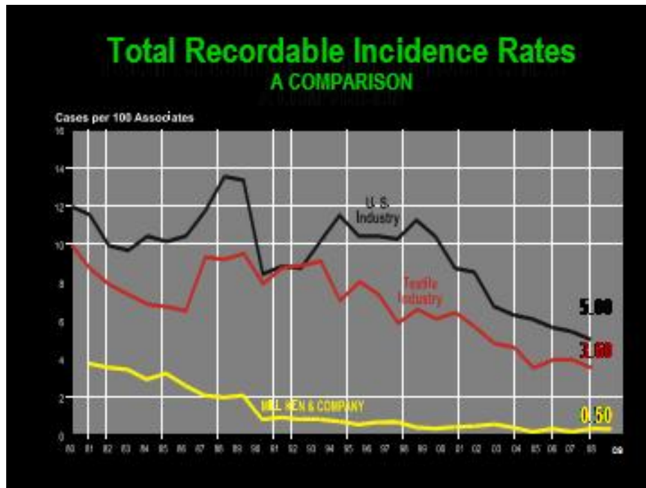
Figure 5. This is the industry trend chart.