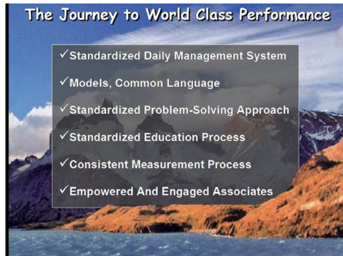
Figure 1. These are the six major keys to world-class safety.

The Milliken Safety System is an uncompromising quest for zero incidents. The Milliken safety journey to world-class safety and operational excellence performances involve six major keys (Figure 1).