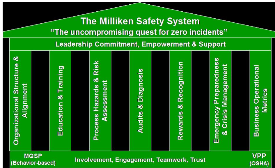
Figure 2. This is a foundation of Seven Pillars of Safety Excellence.