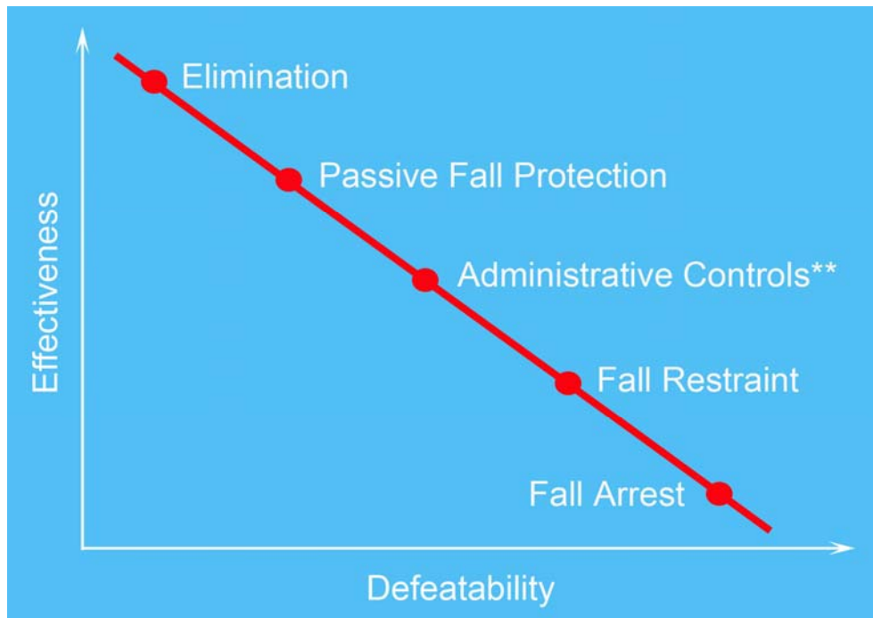
Figure 2. The Hierarchy of Control relates hazard abatement options in terms of effectiveness and ability to be defeated.

After fall hazards have been identified and evaluated, the next step is to control the fall hazards. It is important to evaluate where the solution falls within the Hierarchy of Control. When considering an active fall protective system, the type of system and corresponding anchorage must be evaluated. Because of the variety of types and uses, designing and using anchorages can be complex. It is, however, critical to understand different anchorages, and the ANSI Z359 standard provides helpful information on this topic. It should be noted that the frequency of the task should also be considered when evaluating the best solution. OSHA regulations provide guidelines as to which abatement solutions are appropriate, depending on the frequency of tasks.