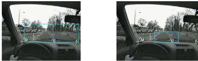
Figure 2. Where Drivers Look When Driving.

In a study performed by Transport Canada, the outlined blue boxes show where drivers looked. Left photo is not using a cell phone; right photo is using a cell phone. Individuals using cell phones also reduced monitoring of instruments and mirrors and made fewer glances to traffic lights and to traffic.