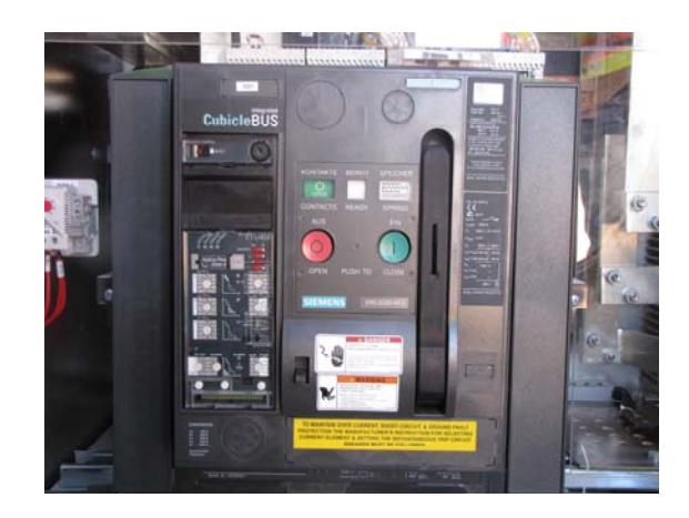
Figure 4: Low Voltage Power Circuit Breaker.

Some farms also insert an LVPCB in the padmounted XFMR, and this proves an excellent (but expensive) choice because it affords the engineers options that most often allow the engineer to reduce IE levels to acceptable levels at ALL points inside the towers. The 34.5KV-side of the padmounted XFMR is most often protected by internal fuses that usually include a Current Limiting (CL) fuse to protect the unit from high SCC faults in-series with expulsion fuses that protect the XFMR against overloads or faults that have SCC of lower magnitudes.