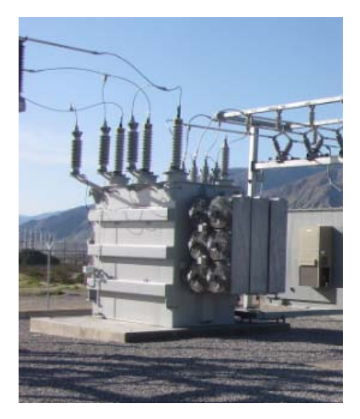
Figure 3: Typical Substation XFMR

The collector system is most often aluminum underground cable that is direct-buried in the earth. These cables can be astoundingly-long in length, sometimes exceeding 7 miles between the substation and the first turbine. The 34.5KV voltage is transformed to transmission voltage via massive Power XFMRs in the substations such as the one illustrated in Figure 3: