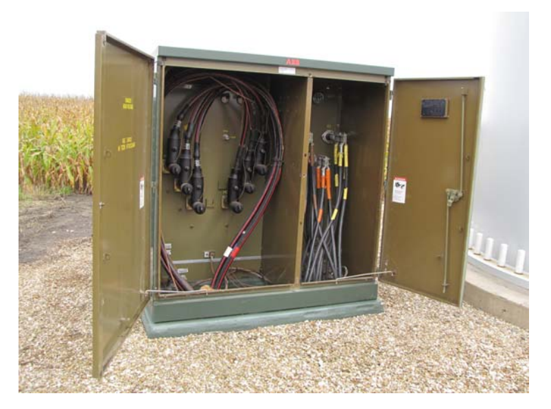
Figure 2: Typical Padmounted XFMR

The collector system is most often aluminum underground cable that is direct-buried in the earth. These cables can be astoundingly-long in length, sometimes exceeding 7 miles between the substation and the first turbine. The 34.5KV voltage is transformed to transmission voltage via massive Power XFMRs in the substations such as the one illustrated in Figure 3: