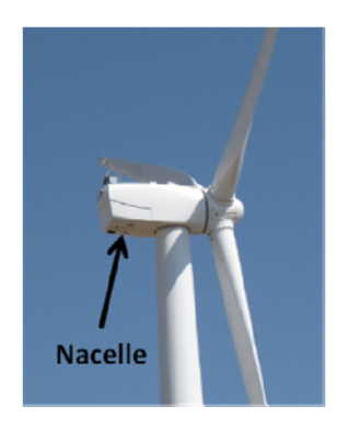
Figure 1: Wind Turbine Nacelle.