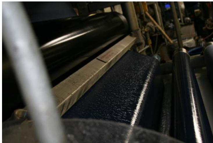
Exhibit 3. Fabric goes through the finishing process.

After the fabric is spun and woven, the fabric is dyed and finished. The dye process is where color is imparted into the fabric. For inherently FR fabric, dyeing and finishing is the final process. For flame retardant treated fabric, once it is finished and dyed, undergoes a chemical treatment process. The treatment process chemically alters the fiber, imparting the flame resistant characteristic. Many FR treated fabric manufacturers impart permanent flame resistance, while others provide treatments that are not durable over time.