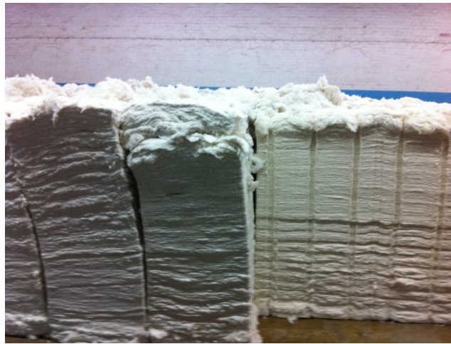
Exhibit 2. Bales of cotton await spinning.