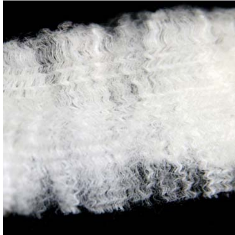
Exhibit 1. A closeup of Protex® fiber.

is, itself, flame resistant, and there is no need for FR treatments. The treatment process ensures the sustainability of flame resistance over time. FRMC® is one example of an inherent fabric that utilizes Protex® fiber, while Nomex IIIa® is an example of an inherent fabric that uses Nomex® fibers.