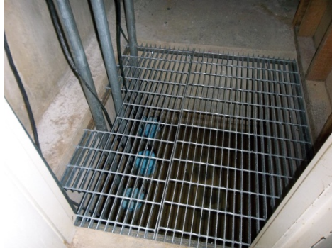
Exhibit 4. Sump Pit with 4 Pumps