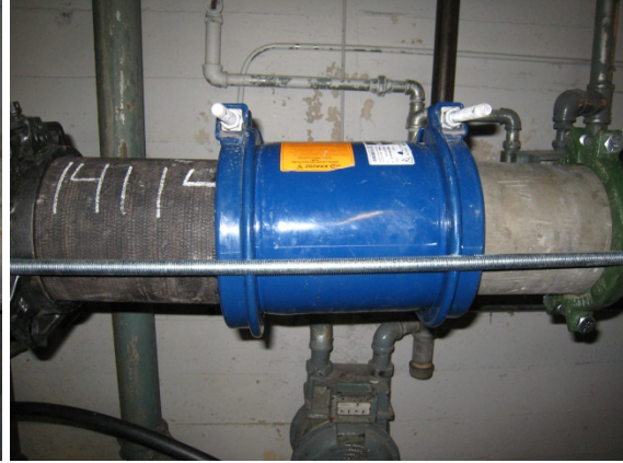
Exhibit 2. Close-up of Piping Assembly