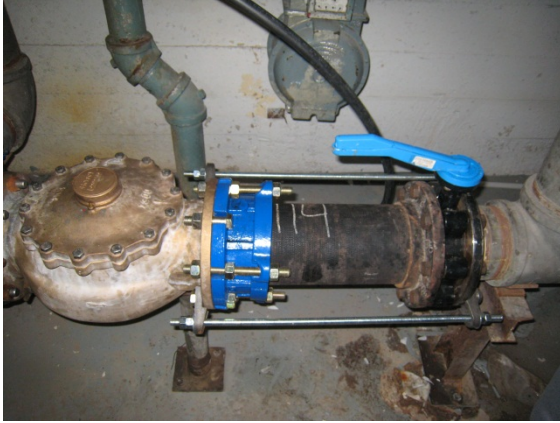
Exhibit 1. Piping Assembly