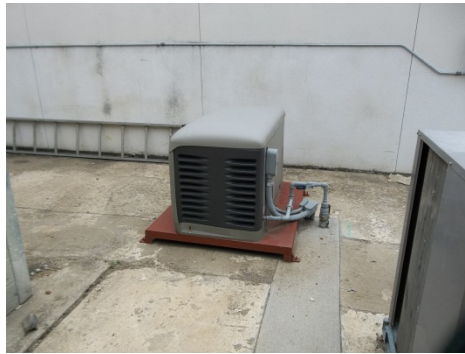
Exhibit 6. Small Emergency Generator

They also added a small emergency generator to provide emergency power to the sump pumps, magnetic locks on the doors (that would unlock upon loss of power), and to the computer room servers.