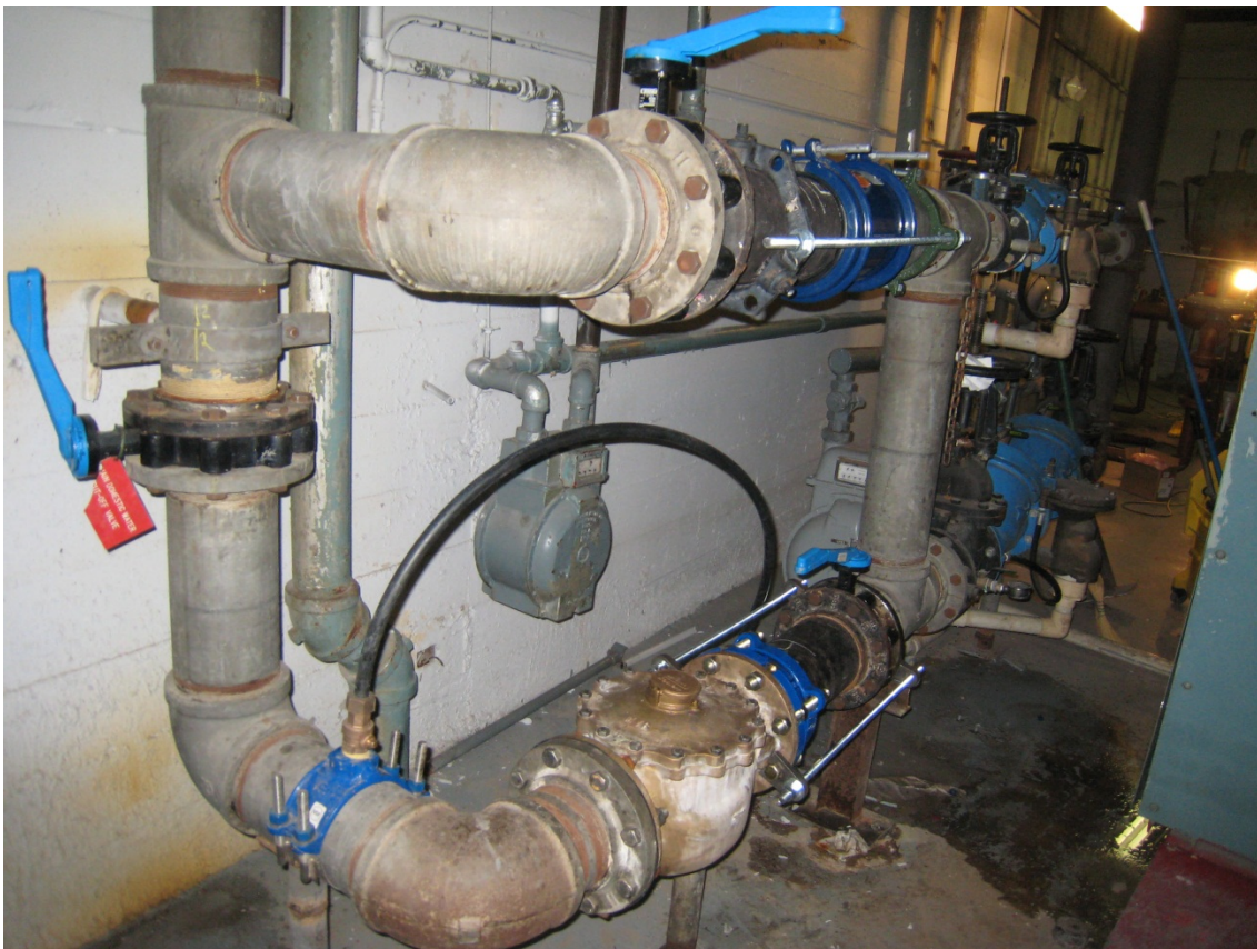
Exhibit 3. Overall Piping Assembly