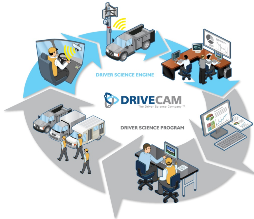
Exhibit 1. Process of Review of Risky Driving Behavior

commonly affixed to the windshield and is loop recording in front, as well as inside, the vehicle. When the vehicle experiences substantial force, such as hard braking or swerving, the device is triggered to save the 8 seconds before the moment of force as well as an additional 4 seconds afterward. The net result is a video that reveals what happened and why. This video is then uploaded to a review center, where it is objectively reviewed and assessed for risk. Events with a significant level of concern are then directed to the client for driver coaching via a web platform. Exhibit 1 illustrates this process.