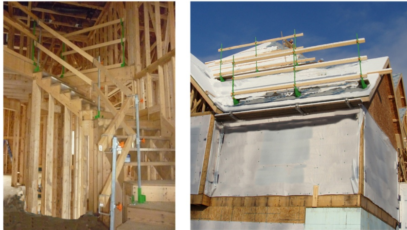
Figure 3. Left view shows the flat and vertical components of the guardrail system being used to construct a temporary handrail. Right view shows two separate guardrail systems, constructed of the roofing components, installed on a large 45° sloped roof.

from the workers helped to develop a patented (U.S. Patent No. 7,509,702) multifunctional guardrail system that can be used on roofs, as well as on stairs and floors to protect workers from falling through holes or from unguarded edges (Bobick and McKenzie). The guardrail system has been in use by one northern West Virginia construction contractor for more than 18 months. This contractor has used the system on at least six different job sites with great success. The guardrail system is available for commercial development through a licensing agreement with CDC-NIOSH. Figure 3 provides two views of the system in use on different residential construction sites.