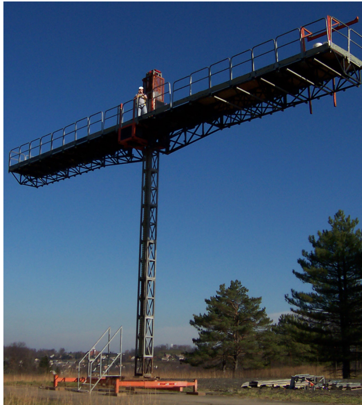
Figure 5. View of the mast climber equipment to be used in future Division stability tests.