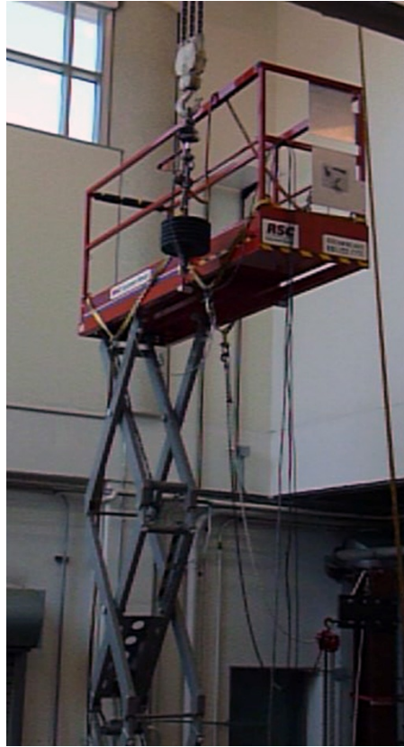
Figure 4. View of the scissor lift extended (almost 20 ft.) in the Division's High Bay Lab during stability testing.