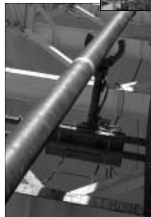
Mechanized equipment on the drilling rig has the following component groups: mechanized power tongs for casing, tubing and drill pipe (Photo 1, top); tong positioning systems for these mechanized tongs (Photos 2 and 3); and the stabberless system (Photo 4, left).