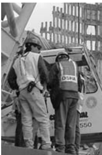
Photo 14 (top): The north face of 130 Liberty St. The broken windows were eventually covered completely with protective, flame-retardant netting.