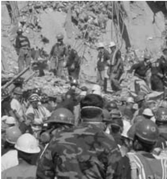
Photo 5 (above): The site was flooded with people trying to assist, many wearing no or improper PPE.