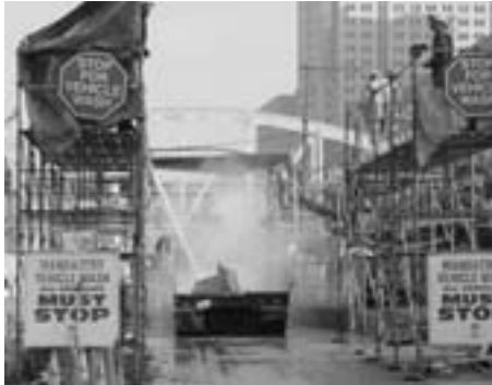
Photo 10 (below, right): A massive amount of heavy equipment was mobilized to assist in the recovery effort. This photo shows only the southwest corner of the 16-acre site.

Photo 9 (right): Laborers clean 1 Liberty Plaza. At the time the work was being performed, consistency of the dust was not known.