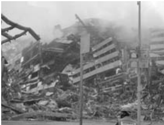
Photo 2 (above, left): WTC-7, a 47-story building destroyed in the attacks.