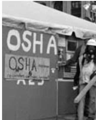
Photo 6 (above, right): One of OSHA's PPE distribution centers and respirator fit test stations near the disaster site.