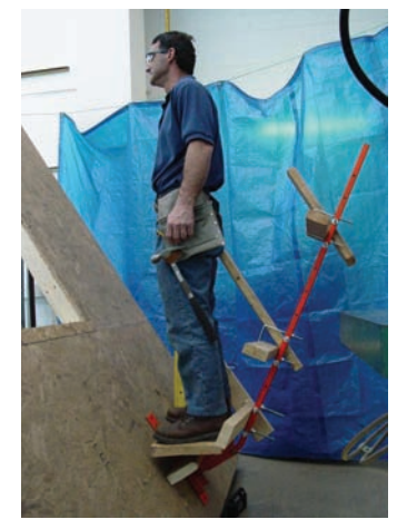
Photo 1: NIOSH developed an adjustable roof-guardrail assembly to protect workers from falls from roof edges, roof holes and existing skylights. It can accommodate a roof pitch range of 27° to 63°.

workers were killed and more than 3,260 workers were seriously injured after falling from roofs (BLS, 2005a, b). Research to understand human fall mechanisms and to identify preventive measures is critical to the reduction of fall-from-roof incidents.