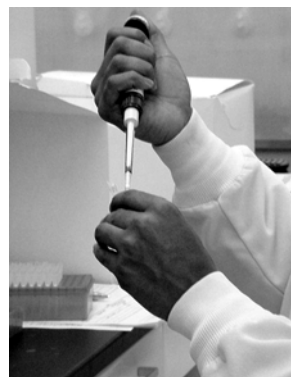
Lab workers commonly use pipettes to measure liquids. When pipetting, a worker's shoulders are raised, elbows generally wing out and forearms rotate, and wrists, hands and thumbs are often held in awkward postures.

Various modified ergonomic pipettes have been designed. Lu and Sudhakaran (2005) reported that postural stresses associated with pipette use "include awkward and static shoulder elevation, forearm rotation, elbow flexion and wrist deviation." They concluded that "the redesigned, low-force pipette showed a significant reduction in the most important MSD risk factors for pipetting, as compared to two other traditional axial-design pipettes" (Lu & Sudhakaran). This author provided the low-force pipette to two symptomatic laboratory workers in 2006.