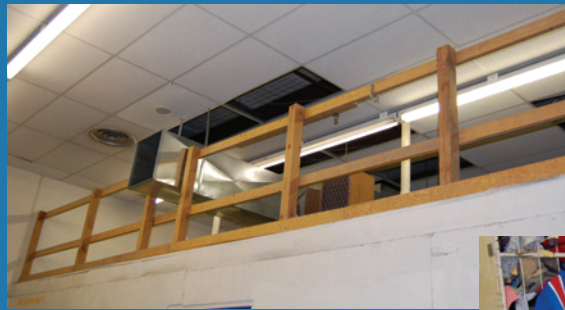
Photo 3 (above): Guardrails along a mezzanine. Guardrails prevent fall injuries when working near open-sided floors or platforms.