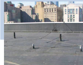
Photo 7: Permanent roof anchor points. By designing fixed, structurally sound anchor point work-

that must be performed above the ground. Prefabricated stairs with railings installed early in a project preclude the need for ladders and temporary guardrails.