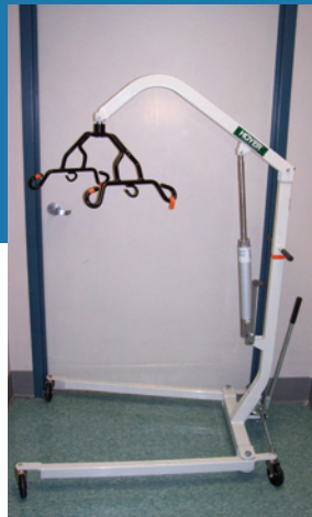
Photo 4 (left): Patient lifting devices can reduce back injuries in the healthcare industry.