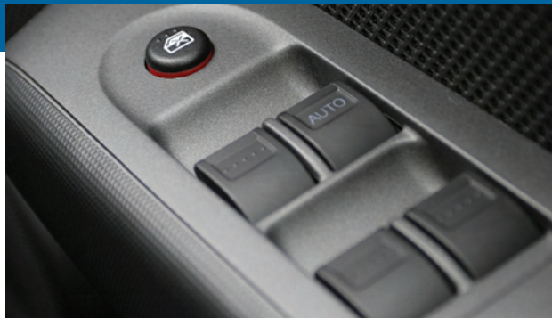
Photo 10: Toggle or rocker-powered car window switches can pose a hazard to children left unattended in a car. The pull-up/push-down switch pictured here significantly reduces this hazard.

Garage doors powered by automatic openers present an entrapment hazard if a person is in the line of the door as it is closing. Children have been reported to play a dangerous game in which they activate the door then run under it as it is closing (CPSC, 1985). A DFS solution would be a noncontact obstruction detection device. Photo 11 (p. 40) shows an automatic garage door operator infrared beam sensor. An object under the leading edge of a down-