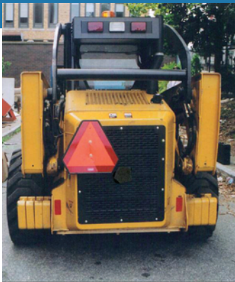
Photo 2: A loader equipped with a rollover protection structure (ROPS).