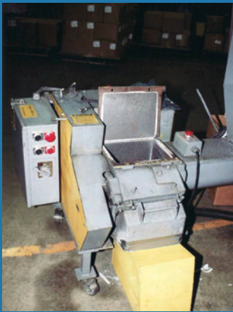
Photo 1 (above): An example of a machine interlock. The access panel is electrically interlocked so that the machine cannot be started when the panel is opened.