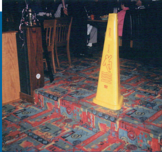
Photo 9: A single step presents a subtle change in elevation that is not easily recognized. A warning cone can help provide some visual cue to patrons.

years—to implement. The result is that consumer hazards are too often managed after the fact through recalls and other policy procedures.