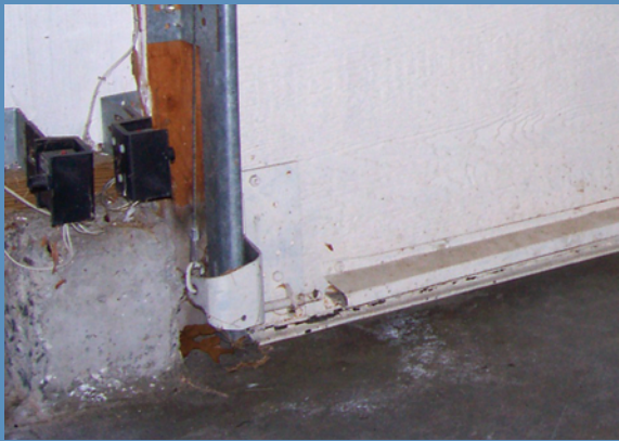
Photo 11: An automatic garage door operator infrared beam sensor. An object under the leading edge of a downward traveling door will break the beam and reverse the door. This system prevents entrapment injuries and fatalities.

ward-travelling door will break the beam and reverse the door. This system prevents entrapment injuries and fatalities, particularly with young children, by sensing the presence of an object without actually contacting the object.