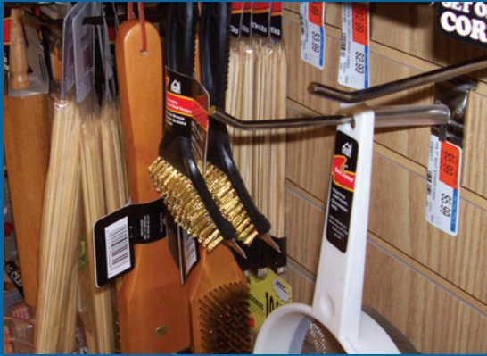
Photo 8: A typical merchandise display used in many retail stores. The display hooks are dangerous because the pointed end can cause eye or facial injuries. Safety loops or guarded hooks should be used.