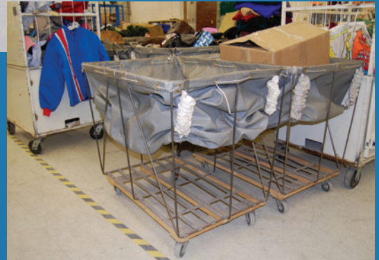
Photo 5 (below): Spring-loaded totes can reduce back injuries in the retail industry because the bottom adjusts to the amount of clothes in the tote. Workers do not have to bend over and reach in when removing clothes.

onward (Driscoll, Harrison, Bradley, et al., 2005). The 2002-12 National OHS Strategy endorsed by Australia's Workplace Relations Ministers Council includes the elimination of hazards in the design stage.