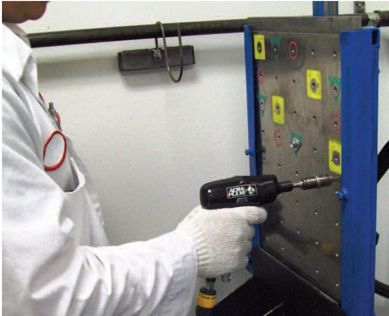
Photo 1: A bolt board helps new associates learn how to properly shoot fasteners and allows them to practice effective ergonomics work methods while shooting fasteners.

are not adequately prepared for the workplace and the work performed.