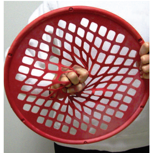
Photo 3: Using a Cando Hand Web (dream catcher) for pronation and supination exercises strengthens the wrist and forearm.

Year to year, the injury rates have continued to drop. In addition, injury rates have shifted away from the first few months on the job to a more normal distribution across the time periods. The improvement trends have continued into FY 2009, with a reduction of approximately 80% compared to FY 2006. These improved trends should be sustainable at about 75% to 80% over the long term.