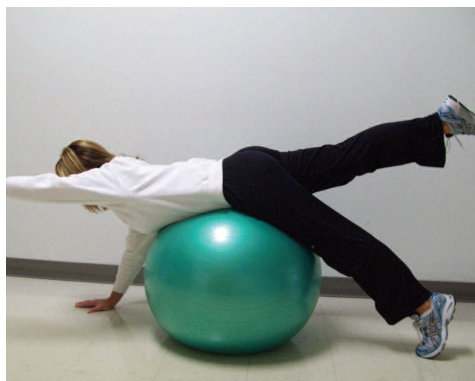
Photo 4: Employee uses a stability ball to perform the "Superman" exercise to strengthen the low back extensor muscles and shoulders.

open communication. Many new employees may be reluctant to speak up if something is bothering them during the break-in period. Some may be afraid to admit that they are having problems or do not want to appear to be underperforming. An open safety culture strives to help all employees. Letting new employees know that the objective is to help them be successful and safe often opens a dialogue. When these pathways are open, employees are also more open to advice on techniques and work methods.