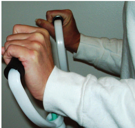
Photo 2: Using therapy bands to perform forearm flexion and extension exercises builds strength and stamina in the forearms.

The stretching, physical conditioning and cardiovascular conditioning also can spark lifestyle changes. Trainers promote the continued use of the wellness center as part of a wellness program when the 2-week orientation is complete. Many new associates also carry the concepts learned into their regular work.