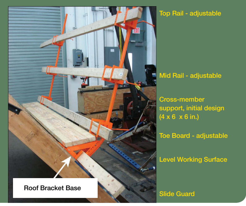
Photo 4 shows the component parts of the bracket-guardrail system. For each of the seven sloped configurations, the plank for the walking-working surface is always level. Also shown in this photo, the design incorporates a slide guard that is perpendicular to the roof slope.

mum required by OSHA 29 CFR 1926.502(b)(1). To ensure that the height regulation is met, NIOSH's system has been designed so the fixtures that support the top rail and midrail can be adjusted. Fixtures are loosened with a handle at the back of the fixture that permits it to be slid up the vertical tube to the required OSHA height.