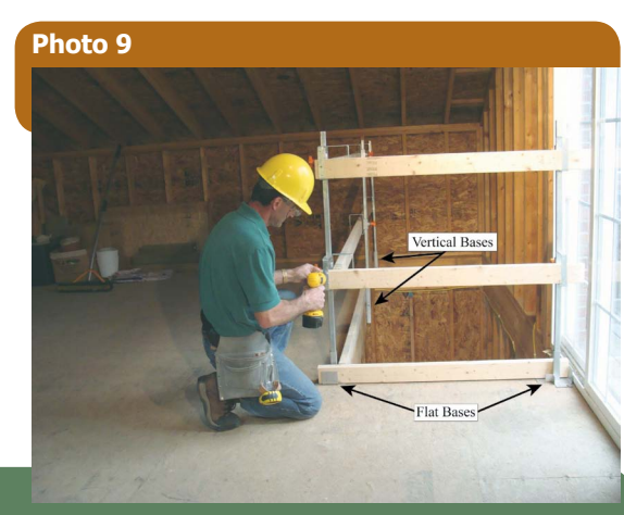
Photo 9 shows the flat and vertical bases being used to install temporary guarding around a large floor opening.

A pneumatic nail gun should never be used to install nails with the metal base plates. A slight misalignment can easily result in a nail ricochet that can severely injure the nail gun operator or a nearby coworker. It is also harder to determine that the nail driven by a nail gun has been correctly inserted into the roof truss, floor joist or wall stud. If the air-driven nails miss the wood underneath, then the protective guardrail is not properly mounted and secured.