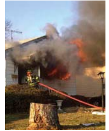
A thorough hazard and risk analysis must be performed before committing responders to action.