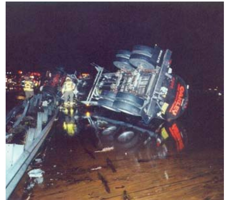
Don't dismiss information without evaluating it. Although the assumption was that the contents of this truck were hazardous, the first report that it contained molasses was accurate.

4) Develop preemergency plans jointly. These plans are used when an emergency occurs. By developing them before an emergency occurs, responders are better able to fully analyze situations and carefully develop safe, efficient plans for vari-