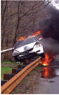
Many incidents occur in locations that are unexpected, such as this burning car perched precariously on a guardrail. Such situations pose even more risk to emergency responders.

ous scenarios. This is a great opportunity for the site team to work with municipal responders and further develop a solid working relationship.