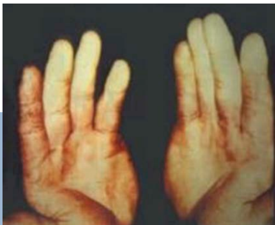
Photo 1: Hands of a vibrating pneumatic hand-tool operator in the later stages of irreversible hand-arm vibration syndrome.

a section on whole body and segmental vibration (Bucher & Geiger, 2003; Wasserman, 2003). (See www.public.navy.mil/navsafecen/Pages/acquisition/acquisition.aspx or www.safetycenter.navy.mil , select the section on acquisition.)