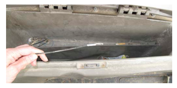
Photo 1: Heavy equipment rental with no operator's manual. The manual should have been attached to the wire shown. The operator cannot safely operate the equipment until one is obtained. This machine had an important piece of safety hardware, an item called the swing lock pin, improperly placed by the rental company.

Section 5.2.5.1: Machines that are not assembled or installed by the manufacturer . . . shall contain the following instructions, if relevant: (-) requirements and